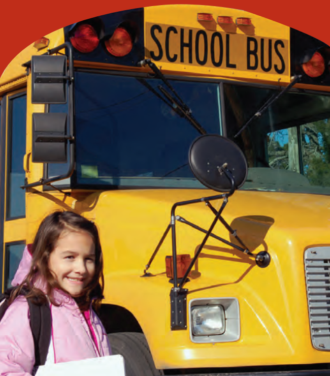
Open Your Heart helps thousands of kids get the resources they need to stay in school while their families are homeless.