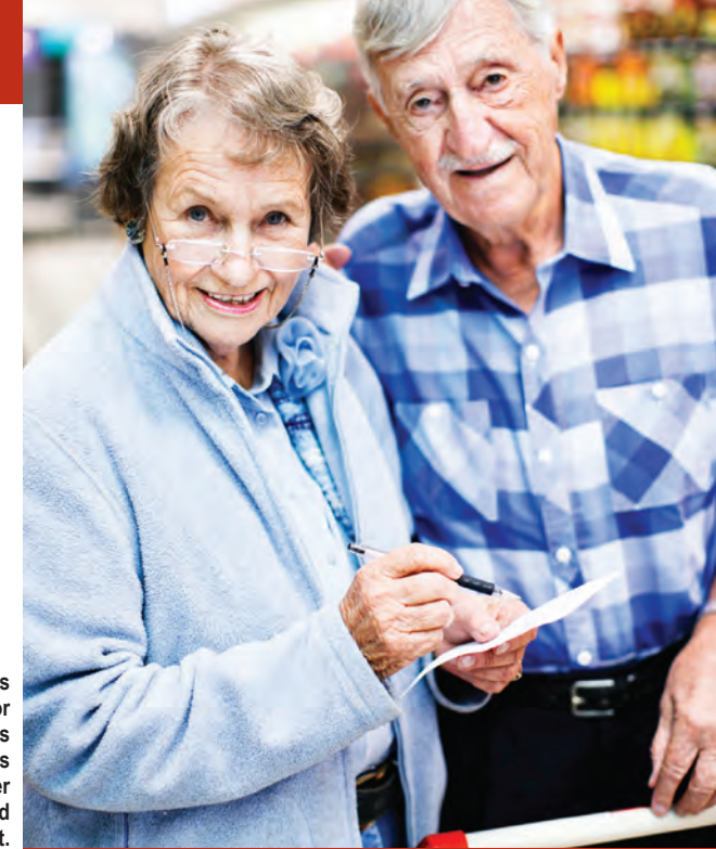
Food shelves are a lifeline for many seniors who receive as little as $16 per month in food support.